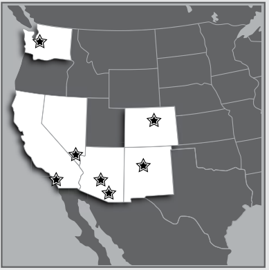
AZ: Mesa, Tucson CA: San Marcos CO: Denver NV: Las Vegas NM: Albuquerque WA: Renton