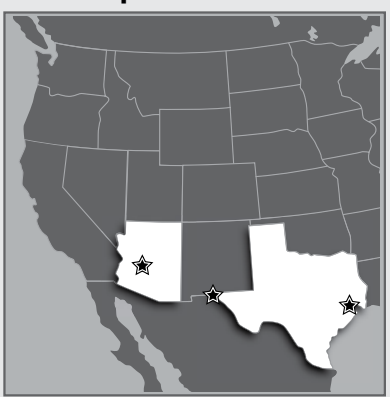
AZ: Phoenix TX: El Paso, Houston