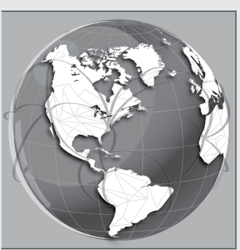
The Online programs are delivered from Tucson, AZ.