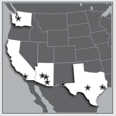
AZ: East Valley, Phoenix, Tucson CA: San Marcos

TX: El Paso, Houston, San Antonio WA: Renton