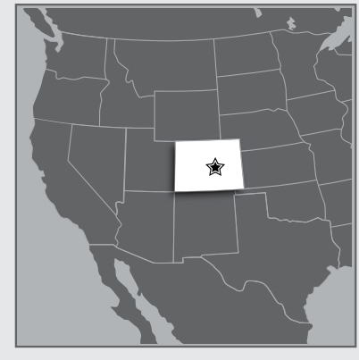
CO: Colorado Springs