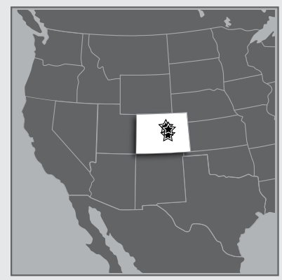
CO: Aurora, Colorado Springs, Denver