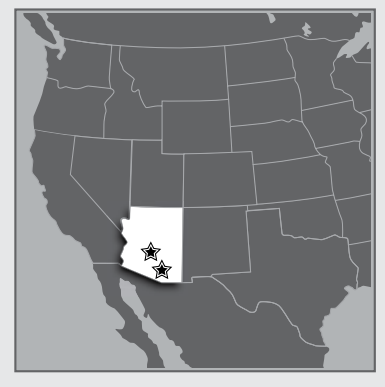
AZ: Mesa, Tucson