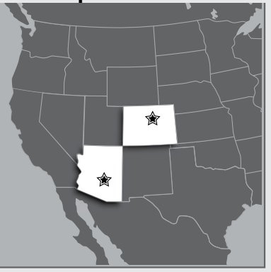
AZ: East Valley CO: Denver