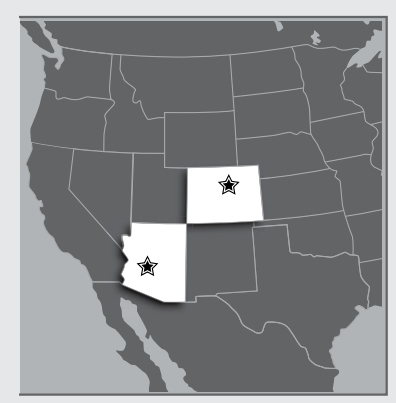
AZ: Phoenix CO: Denver