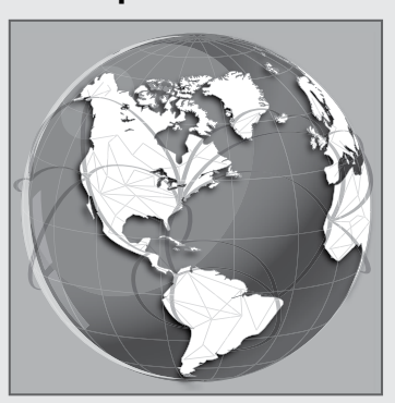
The Online programs are delivered from Tucson, AZ.