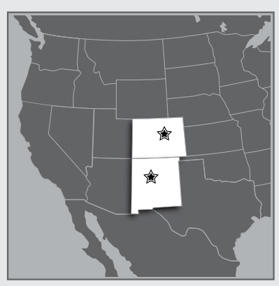
CO: Aurora NM: Albuquerque