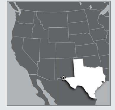
TX: El Paso