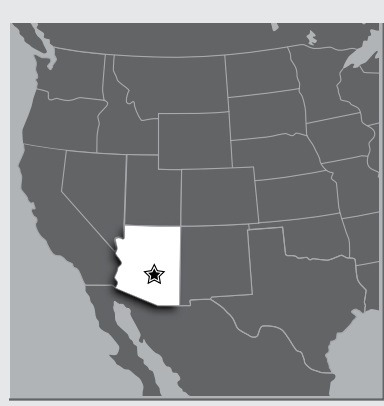
AZ: East Valley