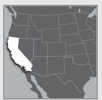
CA: Chula Vista, San Marcos