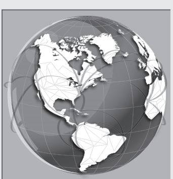
The Online programs are delivered from Tucson, AZ.