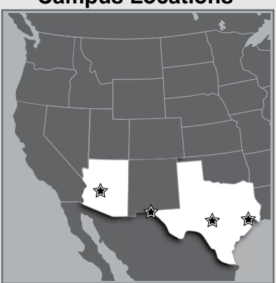
AZ: Phoenix TX: El Paso, Houston, San Antonio