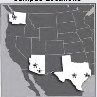
AZ: Phoenix, Tucson TX: El Paso, Houston, San Antonio WA: Renton