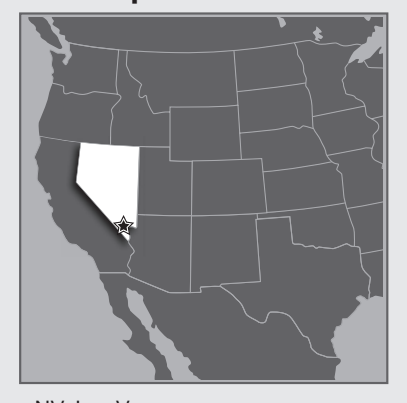
NV: Las Vegas