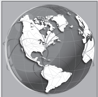
The Online programs are delivered from Tucson, AZ.