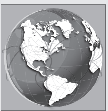
The Online programs are delivered from Tucson, AZ.