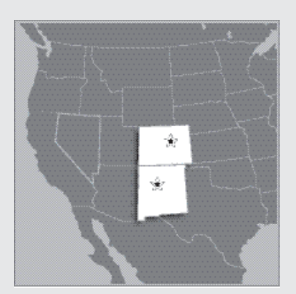
CO: Aurora NM: Albuquerque