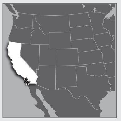
CA: Chula Vista, San Marcos