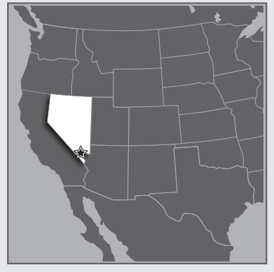
NV: Las Vegas