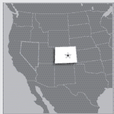
CO: Colorado Springs