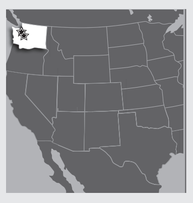
WA: Renton, Seattle