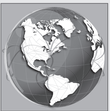
The Online programs are delivered from Tucson, AZ.