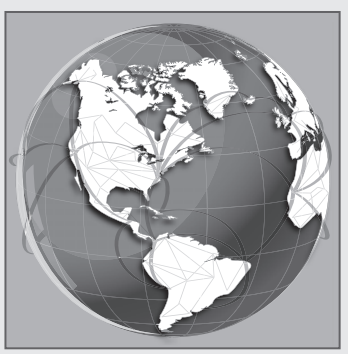
The Online programs are delivered from Tucson, AZ.