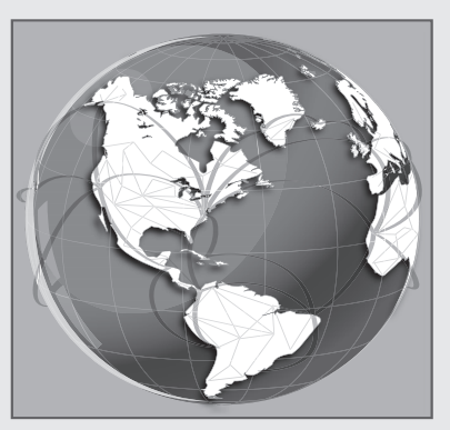
The Online programs are delivered from Tucson, AZ.