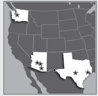
AZ: East Valley, Phoenix, Tucson TX: El Paso, Houston, San Antonio