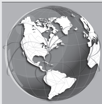
The Online programs are delivered from Tucson, AZ.